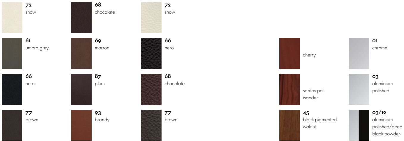
Leather Premium (Lounge Chair classic version)