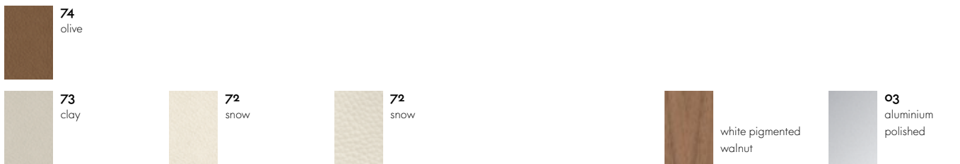
Leather Premium (Lounge Chair white version)